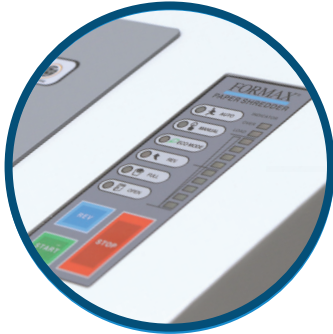
User-Friendly Control Panel: ECO Mode, Door Open Sensor, Reverse, Bin Full Indicator

The Formax FD 87SSD OnSite Multimedia Office Shredder is designed for the modern technological world. It easily shreds mobile phones, SSDs, mini tablets, USBs, and more. The FD 87SSD is whisper-quiet and operates on standard 120V power , making it ideal for the office environment. It features a user-friendly LED control panel , a sturdy all-metal cabinet on casters , solid steel cutting blades , and a rugged chain-driven motor . The separate enclosed infeed options allow users to safely shred a variety of media up to 6.5" wide. With its commercial-grade construction and features, the FD 87SSD sets the standard for safety and security.