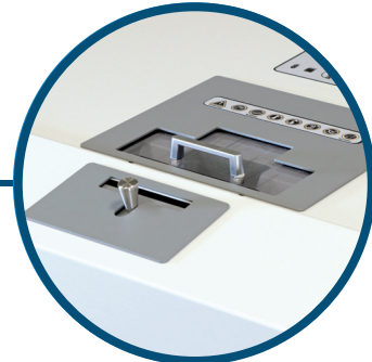
3 Dedicated Infeed Options: Safely feed various size media through the appropriate infeed, up to 6.5" W