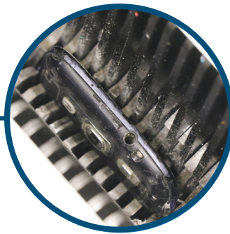
Commercial Grade: Solid-steel heat-treated blades and rugged chain-driven motor