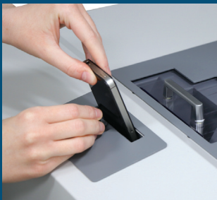
Mobile Phones and SSDs