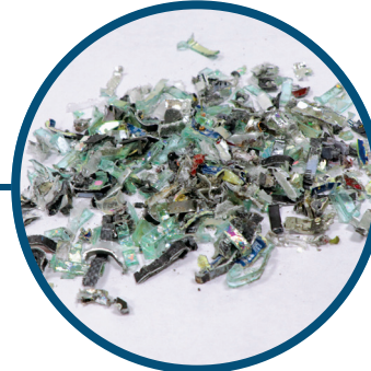
Media Shredding: Shreds media into random pieces up to 0.60". Perfect for security and peace of mind