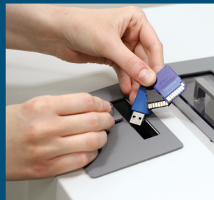
USBs and SD Cards