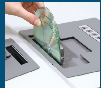
CDs and DVDs

Southwest Binding & Laminating PO Box 150 Maryland Heights, MO 63043-9150 (314) 739-4400 ~ (800) 325-3628 www.swbindinglaminating.com